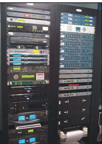
Racks at Allegany's Cumberland Facility

inquiry@axiaaudio.com; or visit http://www.axiaaudio.com/ on the World Wide Web.