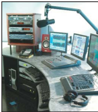
Studio at Allegany's Cumberland Facility

We considered T1, but leasing proved costly. Ultimately, the combination of Ethernet microwave radios with Axia IP audio equipment satis-